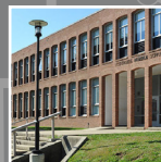
HARRY WEESE FAIRBANKS MALL